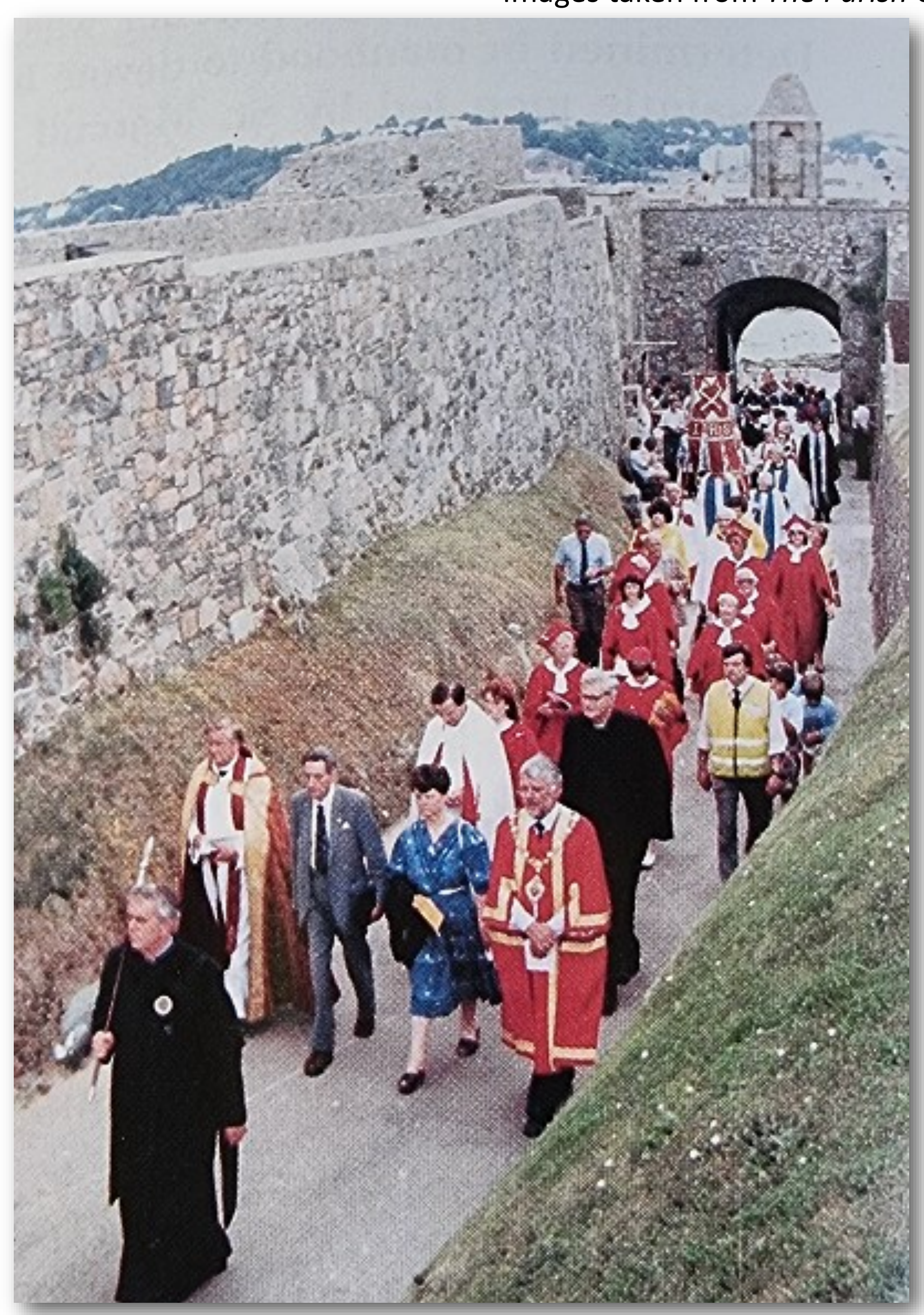
The procession, led by the Dean's mace-bearer, entering Elizabeth Castle