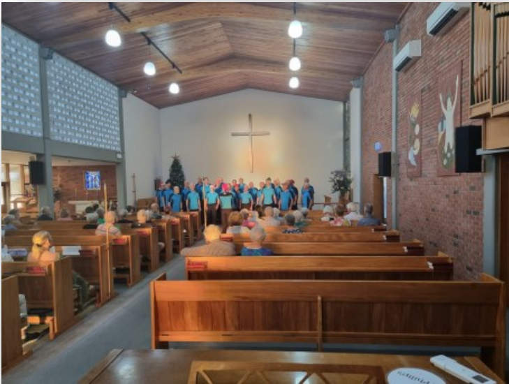
City of Sails Christmas Concert