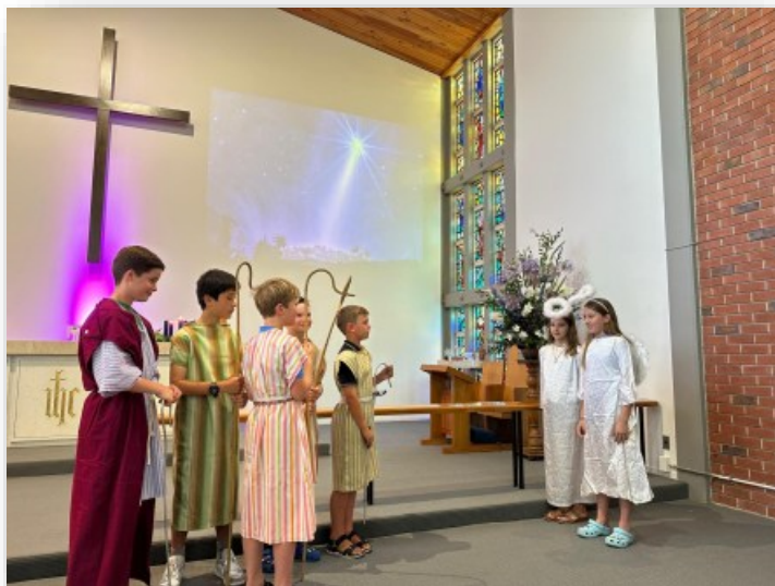
Christmas Services in 2024