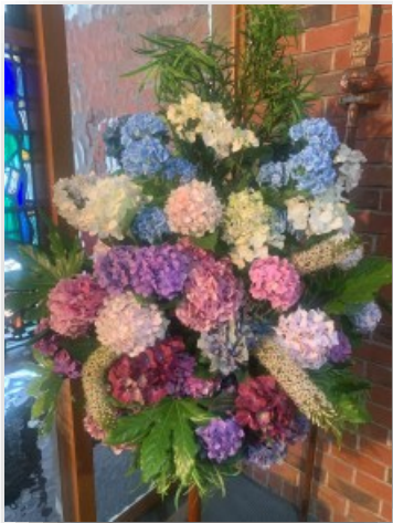
Flower arrangements in the church