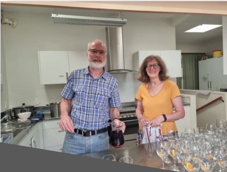
The Mulled Wine Team