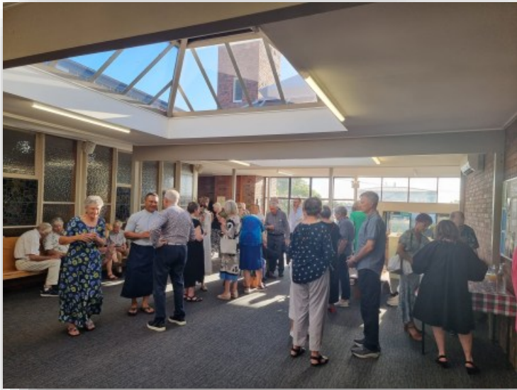
And the Pre-Concert Gathering