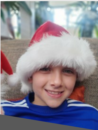
Someone is ready for Christmas!